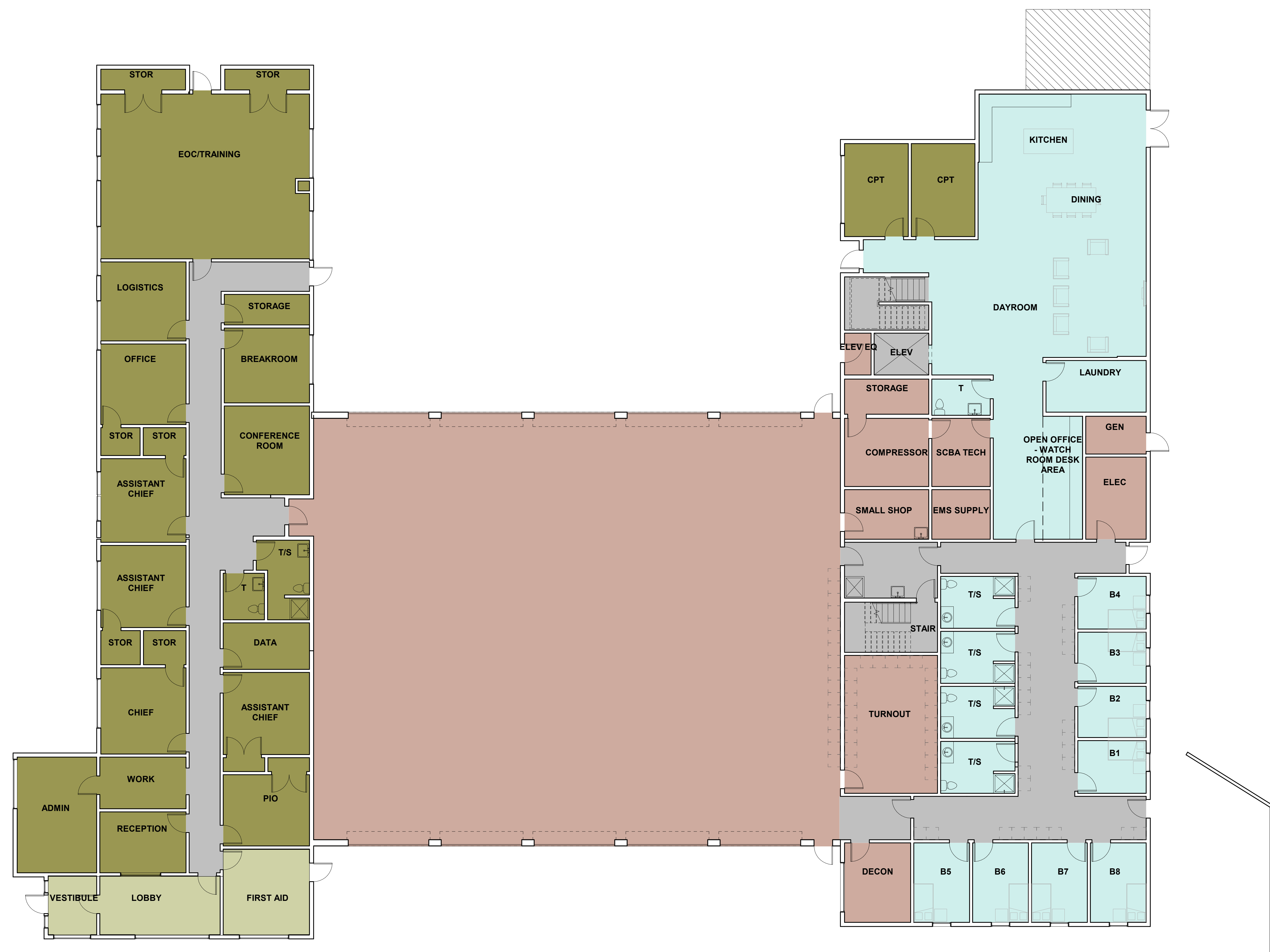
A2.1 FIRST FLOOR PLAN-FLIPPED LIVING SPACE WITH BUMP 1/8" = 1'-0"